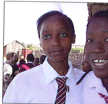
Two teens from Kenya share stories with the CCV-Kenya Team.

will also be at the heart of an educational/vocational training center where hope can become a certain