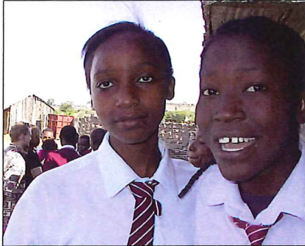
Two teens from Kenya share their stories with the CCV-Kenya Teams

will also be at the heart of an educational/vocational training center where hope can become a certainty and not